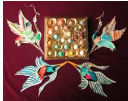
Pacific Gyre Spring —mixed media/recycled material by Louise Towell

Over fifty paintings, sketches, pastels, photographs, mixed media, and sculpture by Metro Vancouver artists will be shown. Visitors may participate in the People's Choice , the winner of which is guaranteed a solo exhibition in the gallery during the 2009 season.