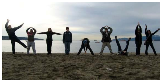
Katimavik January 2008—Burnaby