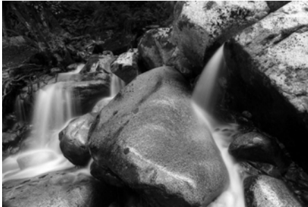
Falls

The process of producing photography has evolved quickly and dramatically with changing technology. Whether an image is captured manually or digitally, and later computer manipulated, it is still the mind's eye that chooses the subject, the angle, and the moment in time. In this collection of work, members of the Burnaby Photographic Society demonstrate the impact of technology on photography through a variety of techniques, styles, and subjects.