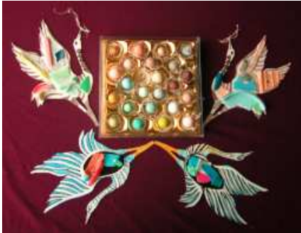
Pacific Gyre Spring —mixed media/recycled material by Louise Towell

Over fifty paintings, sketches, pastels, photographs, mixed media, and sculpture by Metro Vancouver artists will be shown. Visitors may participate in the People's Choice , the winner of which is guaranteed a solo exhibition in the gallery during the 2009 season.