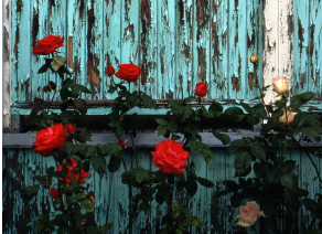
Chinatown I