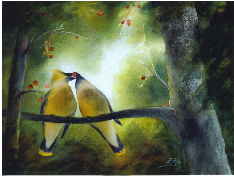
Left: Nurturing , watercolour by Marney-Rose Edge

Artists from the Metro Vancouver region present an exhibition of over forty paintings, pastels, photographs, mixed media, drawings, and ceramics, in the theme of "Spring".