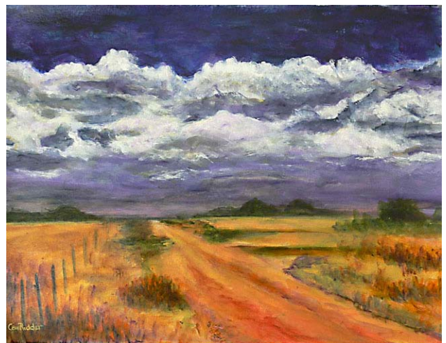
Above: Approaching Storm , watercolour by Carine de Ridder Featured artist at our upcoming show May 23-June 14